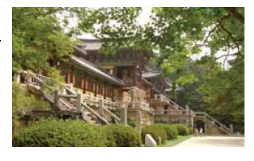
Bulguksa in Gyeongju

The curriculum for the Summer Institute will include cutting-edge technology presentations on a full range of topics relevant to the future of nuclear technology: global setting, international regimes, technology innovation, and nuclear industry operations. Reflecting on previous experiences, considerably more time will be assigned to discussion and the issues forum.