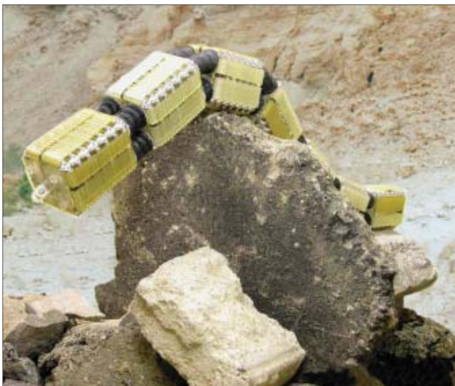
The OmniTread-8 serpentine robot (top) during testing in 2004, and the newer OT-4 moving over a desert location.

mizes coverage of the whole robot body with moving tracks," Borenstein said. "This feature is tremendously important, since because of the long, slender body of a serpentine robot, it is very common that it rolls over in difficult terrain. We found, in fact, that this happens very often."