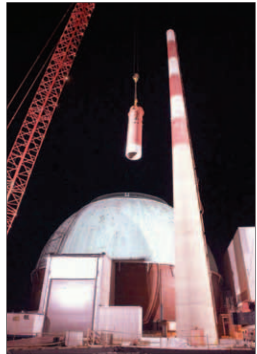
Dismantlement of the plant's red-and-white stack begins. (October 2004)

All that remained of the plant in 2005 were the containment sphere and turbine building. With the interior surfaces of the structures removed, assessed, and sorted for appropriate disposal, the outer shell of the containment sphere was taken apart in