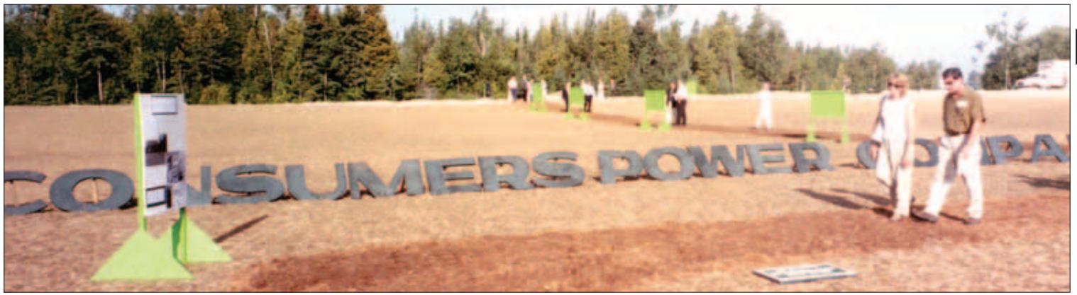
Visitors stroll the walking path around the site of the former Big Rock Point nuclear power plant at the Greenfield Celebration. The Consumers Power Company sign was removed from the administration building before its demolition.