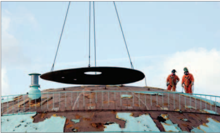
The 9000-lb cap, the first of 90 pieces to be removed and lowered to the ground, is lifted from atop the containment sphere. (September 2005)

Continued from page 39 with the plant gone—with a grand view of Lake Michigan.