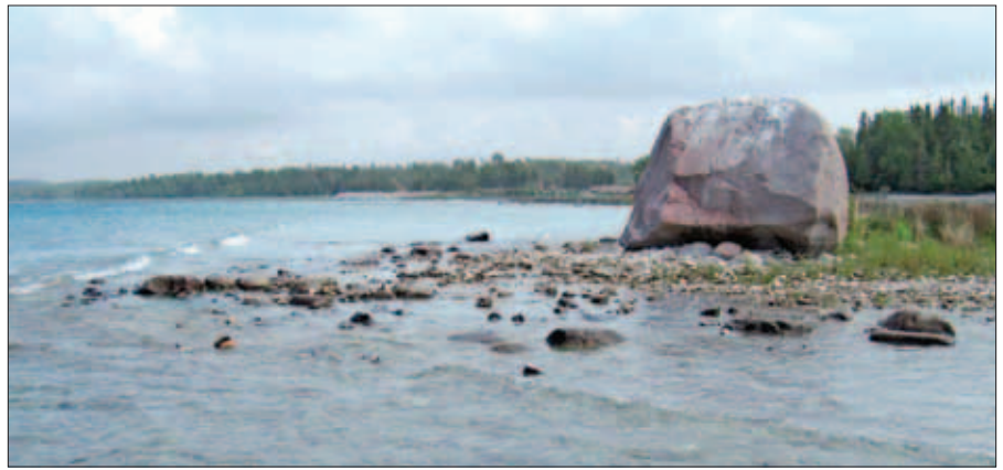
The Big Rock Point nuclear plant is gone, but its namesake remains.

All stakeholders were represented in a ceremonial planting of the first tree on the newly cleared site. And just when it seemed