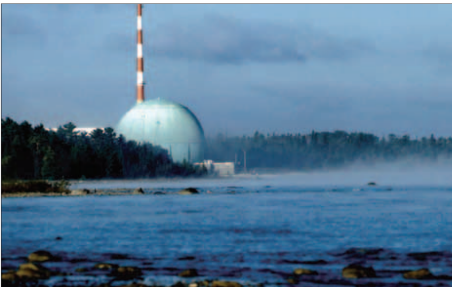
Big Rock, in its scenic location on the shore of Lake Michigan

one of the first voluntary risk assessments following the publication of the 1975 WASH-1400 Reactor Safety Study. The modifications that Big Rock proposed to enhance the safety of the plant drew approval from the Nuclear Regulatory Commission as meeting the intent of the recommendations of the study.