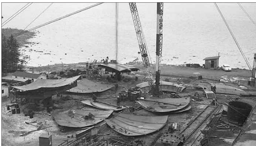
Pieces of the plant's trademark sphere, at the site and awaiting assembly

Even considering the plant's short construction time relative to those that were