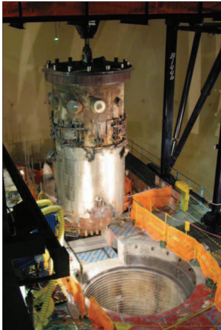
The reactor vessel is hoisted from its concrete cavity. (August 2003)

After the actual closure of the plant, Consumers advised the NRC of its change in plans and revised its decommissioning plan—its PSDAR—to reflect its desire to immediately decontaminate and dismantle the plant. This new plan was approved by