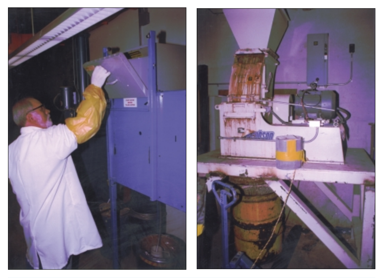
(Left) Loading scintillation vials into the vial crusher's bin. Liquid is drained into the bottle at the lower right, and the crushed glass and plastic go into a separate drum. (Right) The old vial crusher could only be used by climbing a ladder to dump vials into the funnel. This unit is now in the process of being decontaminated and removed for disposal.