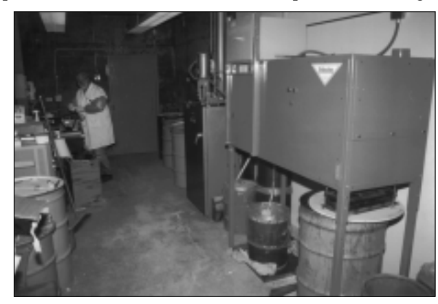
University of Rochester LLRW processing room. In the foreground is the vial crusher with the waste compactor just past it. Technician Chuck Surre is wearing his protective equipment—a lab coat, gloves, safety glasses, and plastic sleeves. Extensive air sampling has never shown evidence of airborne radioactivity

approximately one full-timeequivalent (FTE) staffer available for all aspects of our radioactive waste program. In actuality, this FTE is split among two or three staff members, all of whom have other responsibilities as well. The result is that we have no single person who "lives breathes" and LLRW (figuratively, of course, not literally). As a result, with no dedicated in-house LLRW "guru," we rely on our waste brokers to assist with any nonroutine questions or problems we may have with unusual forms of waste or nuclides with which we have