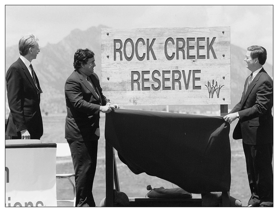
▲ Future land use is a big stakeholder issue. An interagency agreement between the DOE and the U.S. Fish and Wildlife Service sets aside approximately 800 acres of the 6000-acre RFETS Buffer Zone for the Rock Creek Reserve, which will provide habitat for threatened and endangered wildlife along central Colorado's Front Range.

Nothing is more important to the success of a decommissioning project than the support of key project stakeholders.